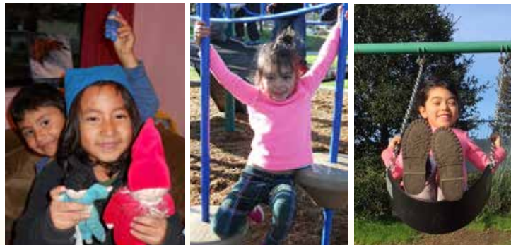
Desde 2004, la población de estudiantes latinos en Woodland Star se ha triplicado y hoy día está a 28% de todos los alumnos inscritos.