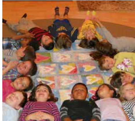
Escenas de las clases alegres de kinder en Woodland Star.