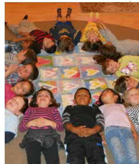
Scenes from lively Woodland Star kindergarten classrooms.